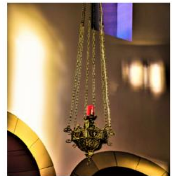
The beautiful sanctuary lamp which hangs above the pulpit, was brought from the old church to the new. For more than 160 years this lamp has been lit to indicate the presence of the Blessed Sacrament.